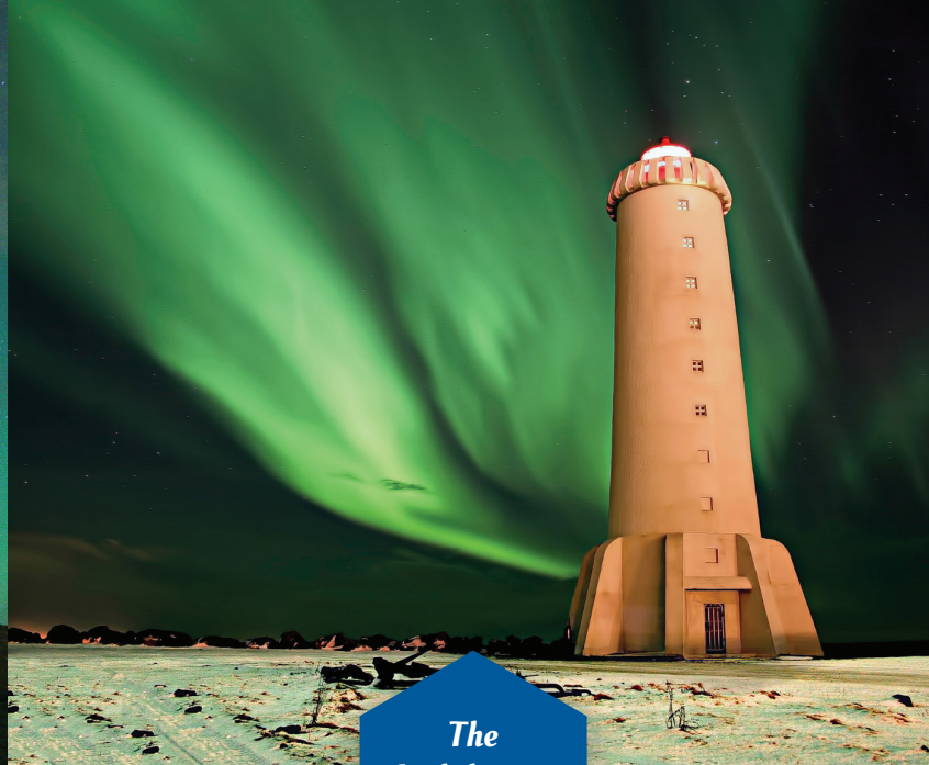
The Lighthouses at Breið

Yuletide lads, Christmas decorations and lights. During the advent the townspeople enjoy and take part in diverse events that brighten up the dark days of December and make the run-up to Christmas fun!