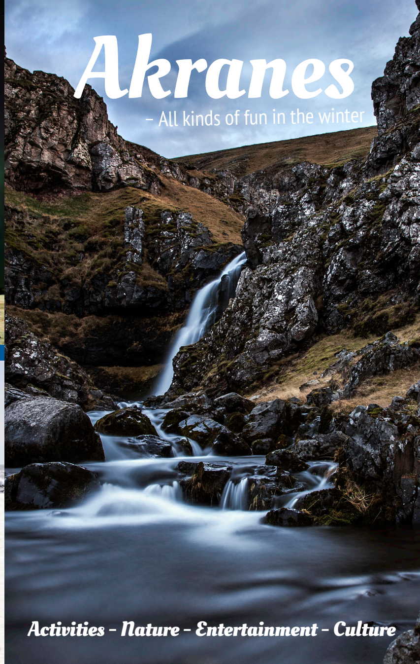
Activities - Nature - Entertainment - Culture

The bird life around the lighthouses is rich and varied all year round. The eider is the most prominent bird there but you can also find ducks, oystercatchers, arctic fulmars and seagulls. The Breið area is a great place for photographers and for enjoying beautiful scenery.