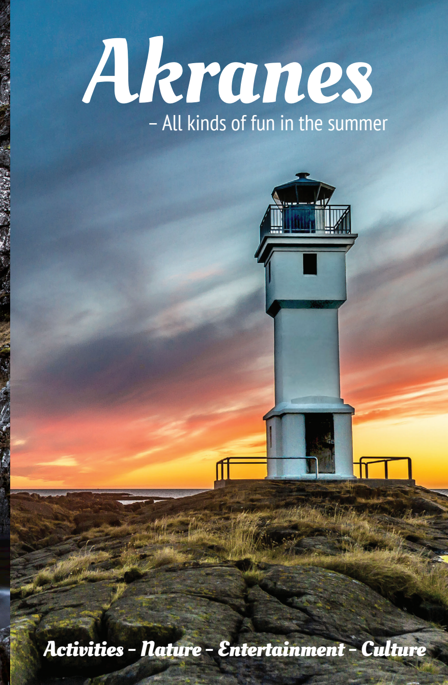
Activities - Nature - Entertainment - Culture